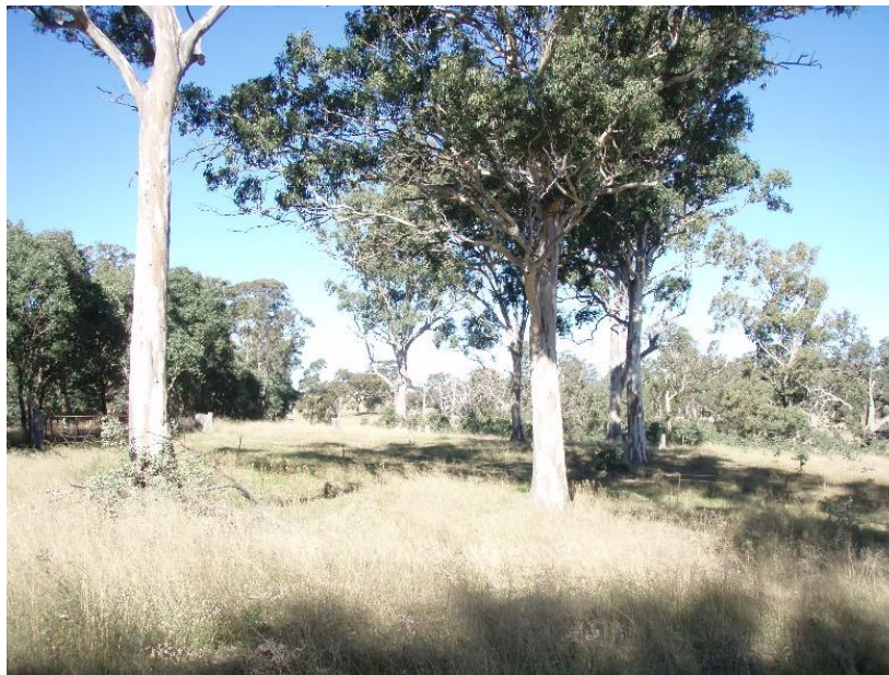
Remnant Eucalyptus tereticornis with some regeneration

Examples elsewhere show that strategic revegetation projects throughout former koala habitat will lead the long term population growth and survival of koalas. The creation of more national parks to "protect" existing populations may not be as effective.